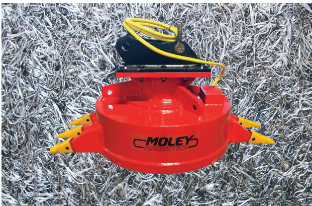
Moley 2-in-1 Sorting Claw Magnet (ESB)